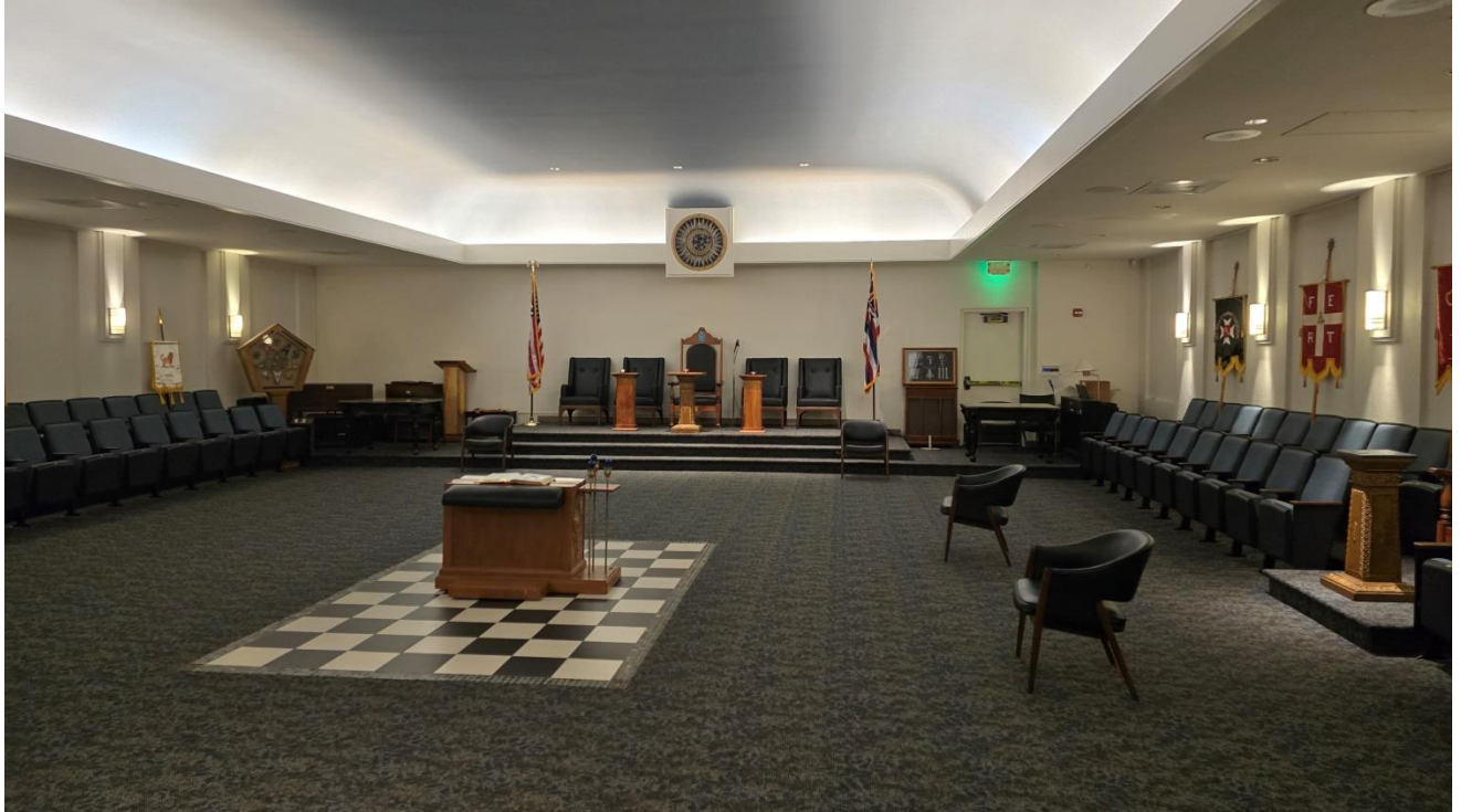
Honolulu Masonic Temple Lodge room